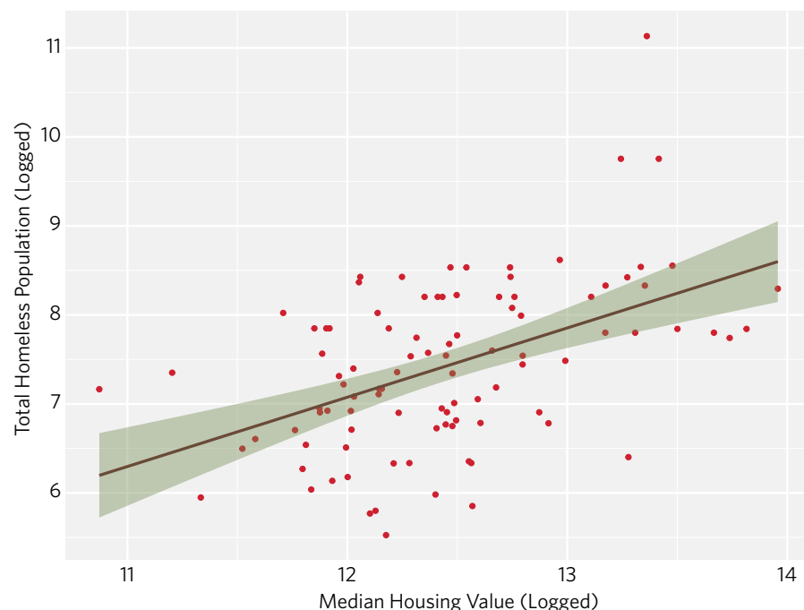
Figure 1. Housing Costs and Homelessness (2020)

Local governments thus play a pivotal role in addressing homelessness. Through their control over land use policy, local governments control what housing gets built in a community and where it can be built. 6 Historically, many local governments passed these policies to explicitly restrict poor people and people of color from accessing their communities. 7 For example, many communities used single-family zoning to prevent apartment buildings from being built, thus preventing the construction of more affordable housing. Contemporary local governments' zoning codes are filled with restrictions that make the construction of multifamily housing (including subsidized housing and housing targeted towards people experience homelessness) difficult or impossible; in addition to single-family zoning, policies like parking minimums, parcel shape regulations, and setback requirements all shape the cost of local housing, as well as the cost of developing other facilities that